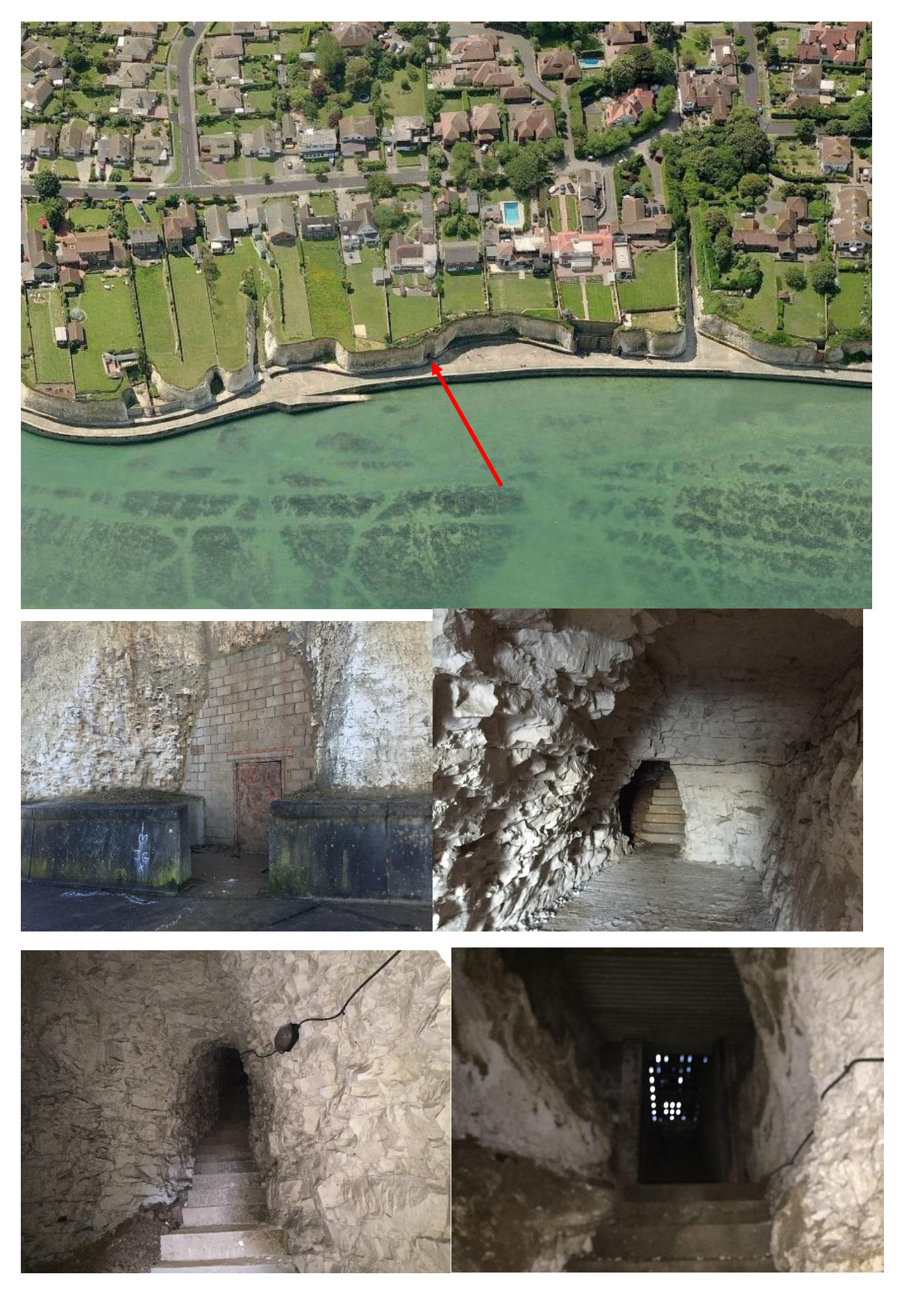
Private. Goes to one of the bungalows again. Blocked off at garden end.